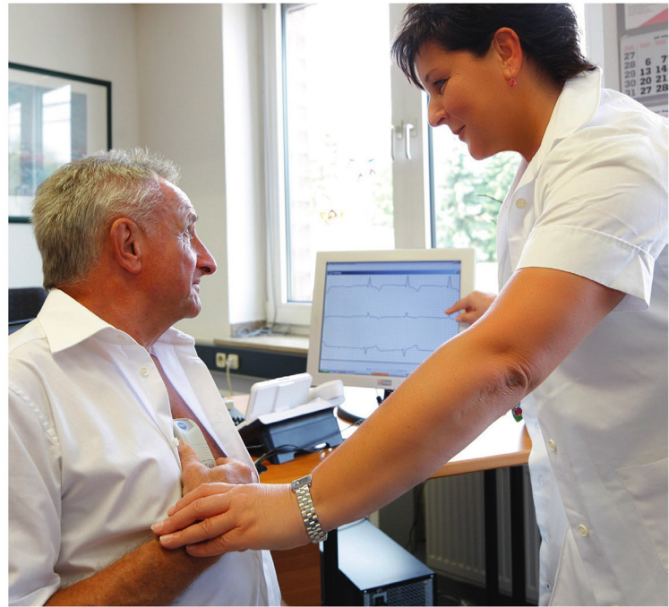
Screening at the practice