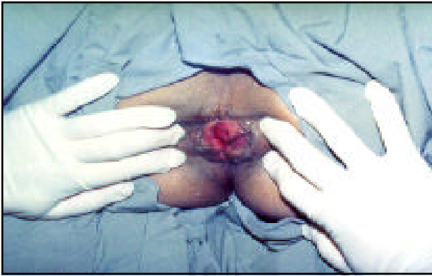
Figure 1 - Size and site of all tags were distinguished.